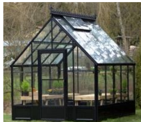
Top: Tier One