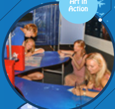
Art in Action