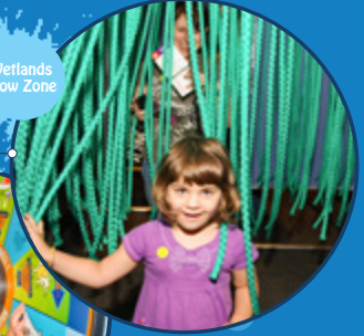
Wetlands Slow Zone