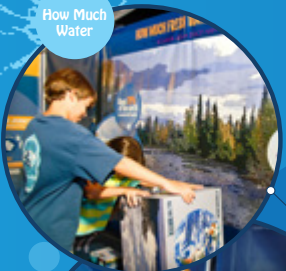
How Much Water