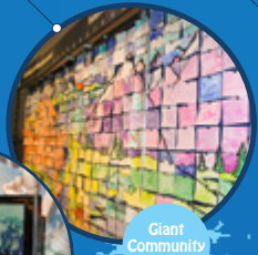
Giant Community Mosaic