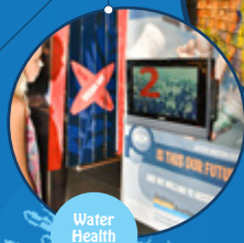
Water Health Video