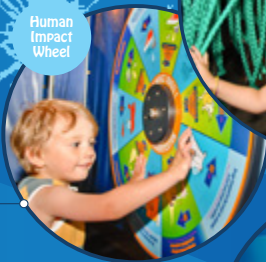
Human Impact Wheel