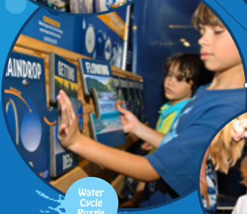
Water Cycle Puzzle