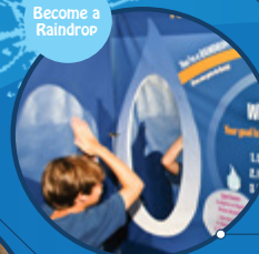
Become a Raindrop