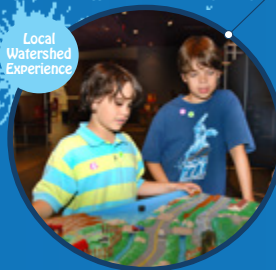
Local Watershed Experience