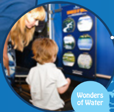
Wonders of Water