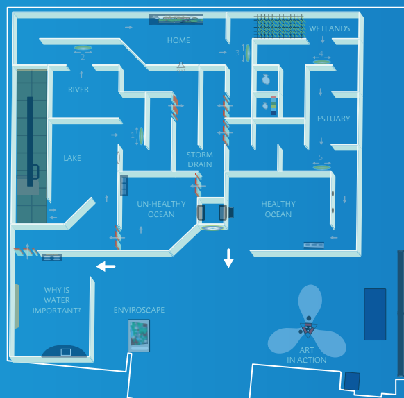
Cleveland Metroparks 1800 sq ft gallery 1450 sq ft exhibit footprint