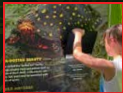
FIND ME IN ZOO FLIP DOORS