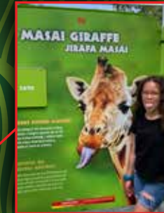
FEATURED SPECIES PANELS