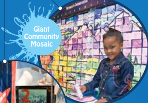
Giant Community Mosaic