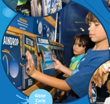
Water Cycle Puzzle