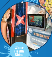
Water Health Video