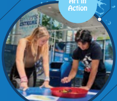
Art in Action