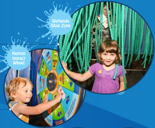
Human Impact Wheel