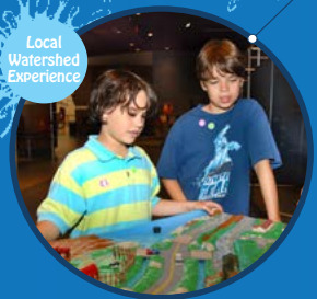
Local Watershed Experience