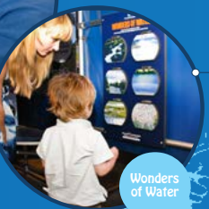
Wonders of Water