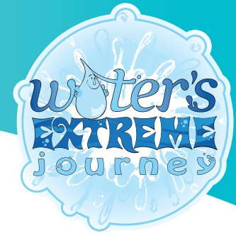
Exhibit Specs - Indoor Version