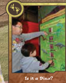
Is it a Dino?