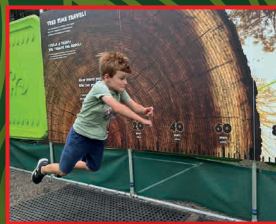
TREE TIME TRAVEL