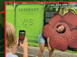
CORPSE FLOWER PEEK