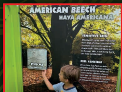
FEATURED SPECIES & FIND ME IN THE GARDENS