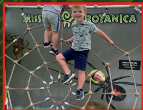
SPIDERWEB CLIMB & PEEK