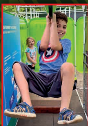
HONEY BEE ZIP SLIDE