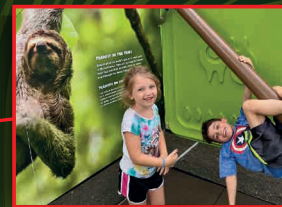
LIANA SLOTH HANG