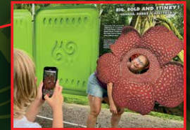
CORPSE FLOWER PEEK