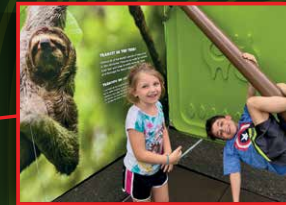
LIANA SLOTH HANG