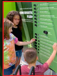
FEATURED SPECIES & FIND ME IN THE GARDENS