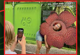
CORPSE FLOWER PEEK