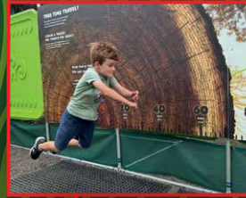
TREE TIME TRAVEL