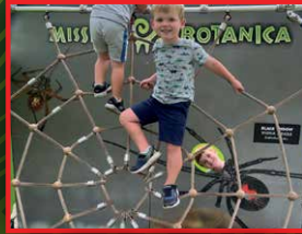
SPIDERWEB CLIMB & PEEK