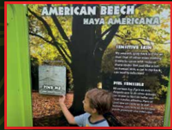
FEATURED SPECIES & FIND ME IN THE GARDENS