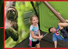
LIANA SLOTH HANG