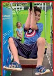
HONEY BEE ZIP SLIDE