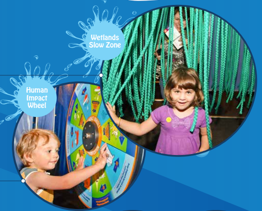
Human Impact Wheel