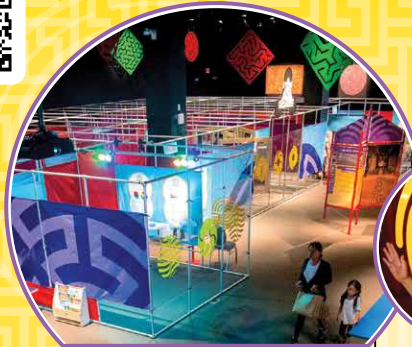
Maze of Illusions