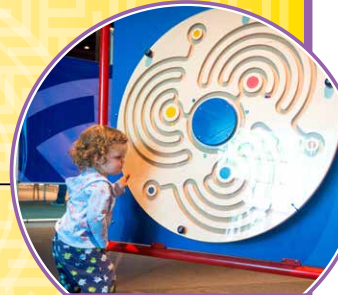
Giant Wheel Maze