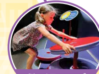
Giant Tower of Hanoi