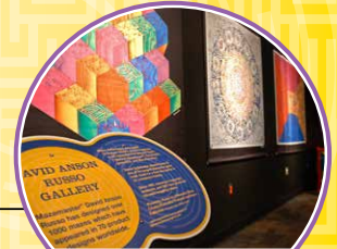
David Anson Russo Gallery