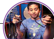
Brain Teaser Puzzles