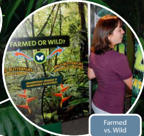
Farmed vs. Wild