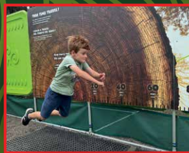
TREE TIME TRAVEL