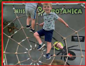
SPIDERWEB CLIMB & PEEK