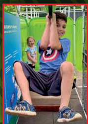
HONEY BEE ZIP SLIDE