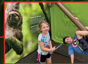
LIANA SLOTH HANG