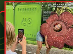
CORPSE FLOWER PEEK