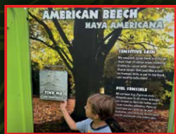
FEATURED SPECIES & FIND ME IN THE GARDENS